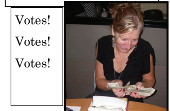
Votes! Votes! Votes!