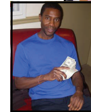
Flash is cash, flash is cash, flash is cash.